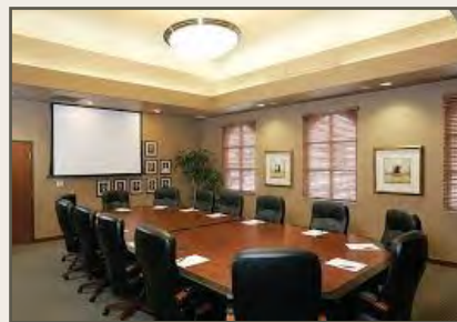
Open Door Board of Directors