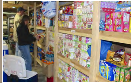
Pine Knolls Alliance Church